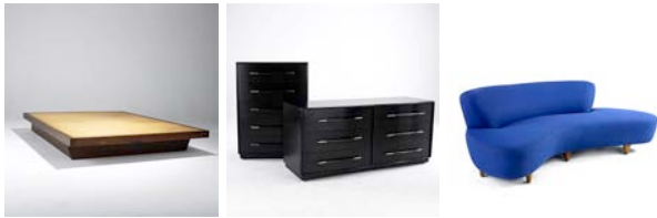
1131: George Nakashima walnut platform queen-size bed; 973: T.H. Robsjohn-Gibbings for Widdicomb long and tall dressers; 1267: Modernica cloud sofa in the style of Isamu Noguchi.