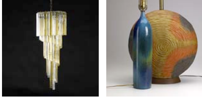
1128: Venini Murano leaded glass chandelier, ca. 1970; 1162: Fantoni two table lamps, one bottle shaped in mottled blue glaze, the other a circular ceramic lamp in warm tones.