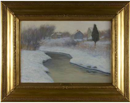
Lot 22 Brook near Weldon by Edward Willis Redfield